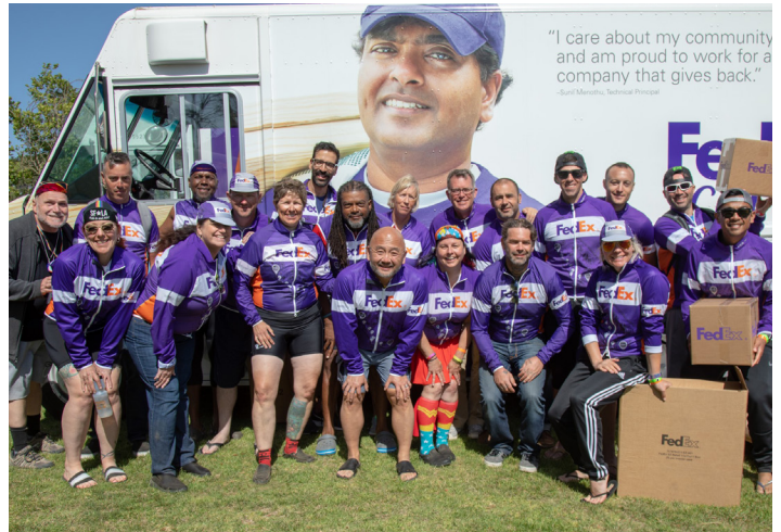
FedEx has supported AIDS LifeCycle since 2005.

FedEx and our team members in California and across the country participate in AIDS/LifeCycle, a seven-day bike ride from San Francisco to Los Angeles to raise money for and awareness of HIV/AIDS. We ride to support the Los Angeles LGBT Center and the San Francisco AIDS Foundation, and as many as 100 team members have volunteered at the event. Additionally, FedEx Office, Freight, and Express all provide vital support to the overall production of the event.