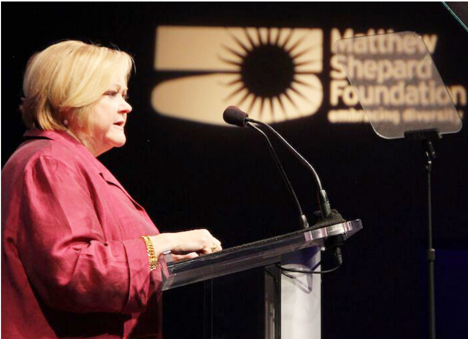
Judy Shepard, Matthew Shepard's mother and founder of the Foundation, speaking on Erasing Hate.

Just as we pride ourselves on being a diverse and inclusive business, we support organizations that accelerate acceptance in our communities. We donate both money and time to nonprofits creating safe spaces, providing academic and career opportunity, and equipping allies in support of the LGBTQ+ community. We envision a culture where everyone is treated with dignity and respect, and can be their true authentic selves at home, at work, and in the community.