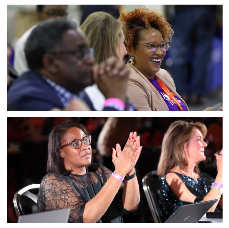
FedEx team members judging WBENC pitch competition.

The WBENC Collegiate Accelerator is a three-month program designed to guide collegiate female founders through their startup phase. Student founders participate in virtual educational sessions focused on the fundamentals of growth, and will also showcase their ventures to more than 4,000 attendees at the WBENC National Conference! Participating entrepreneurs receive mentorship and support from the WBENC network of leading woman-owned businesses and America's Fortune 500 Corporation, and also participate in a pitch competition with a chance to win seed capital funding.