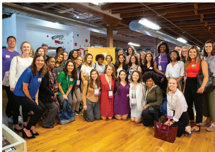
2019 WBENC Student Entrepreneur Program (SEP) Cohort.

This year, during the WBENC Student Entrepreneur Program (SEP), FedEx worked directly to mentor student entrepreneurs in perfecting their 90-second business pitch. One of the entrepreneurs FedEx coached, SoulMuch, which makes vegan and gluten-free cookies from upcycled food waste, won $4000 and took home fourth-place honors.