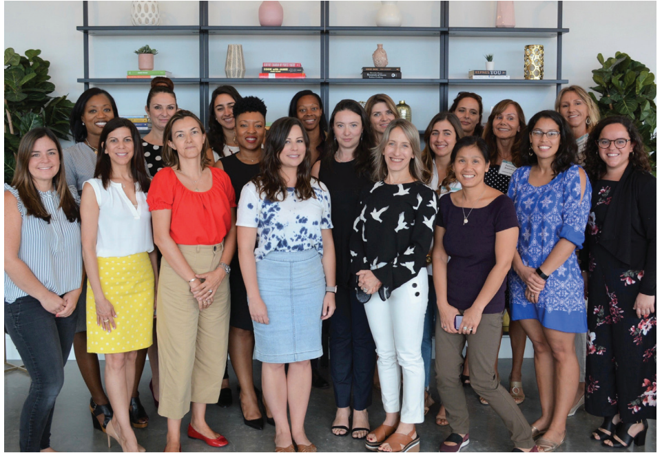
The 2018-2019 WIN Lab Cohort